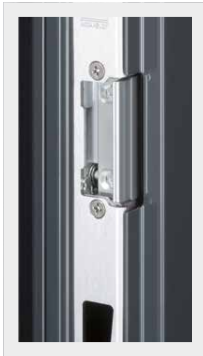
Metal – PREVIOUS fit: