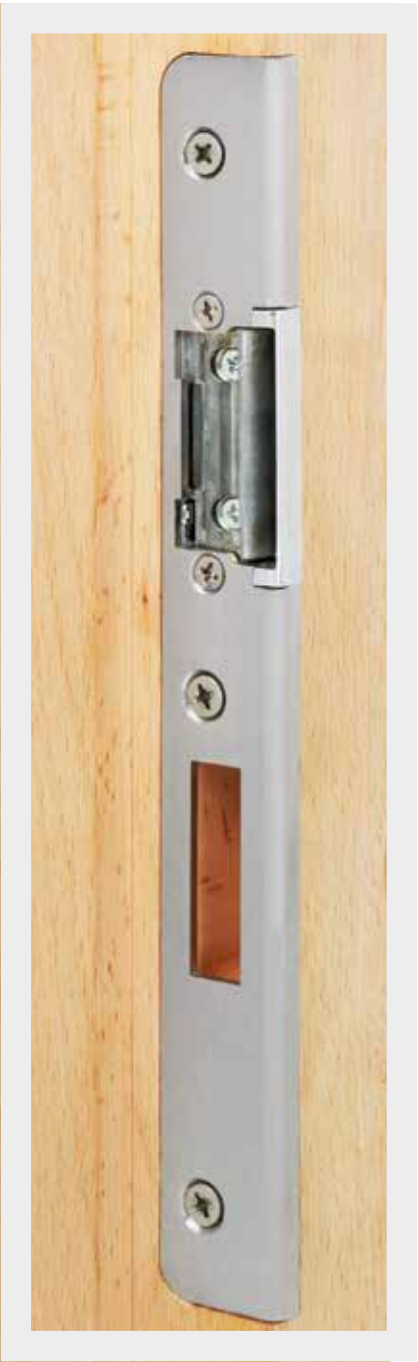
All radius electric strikes are compatible with ProFix®.

The small dimension on the front side is shortened in slim angled striking plates to ensure that the door rebate covers the striking plate when the door is closed.